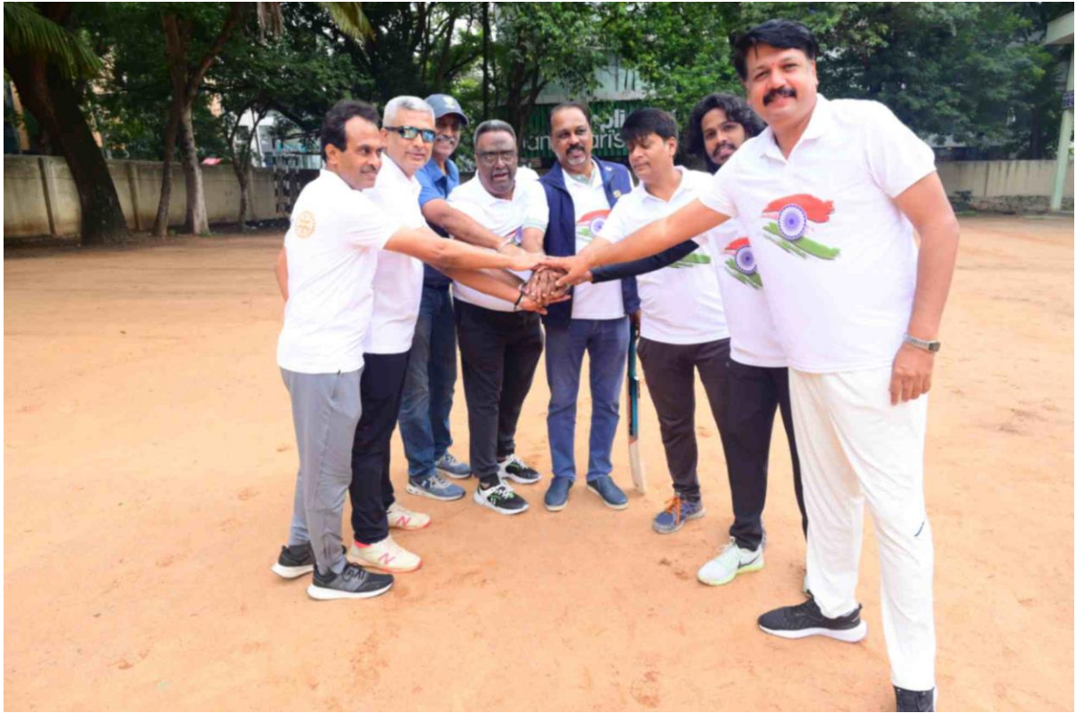
Figure 4: Friendship Day Cricket – DG, Club Presidents with Captains