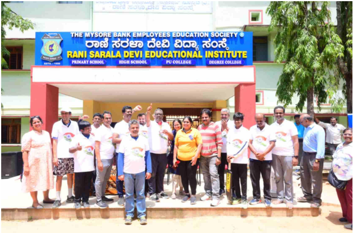
Figure 5: Rotary Club of Bangalore Prime with Runners up Trophy