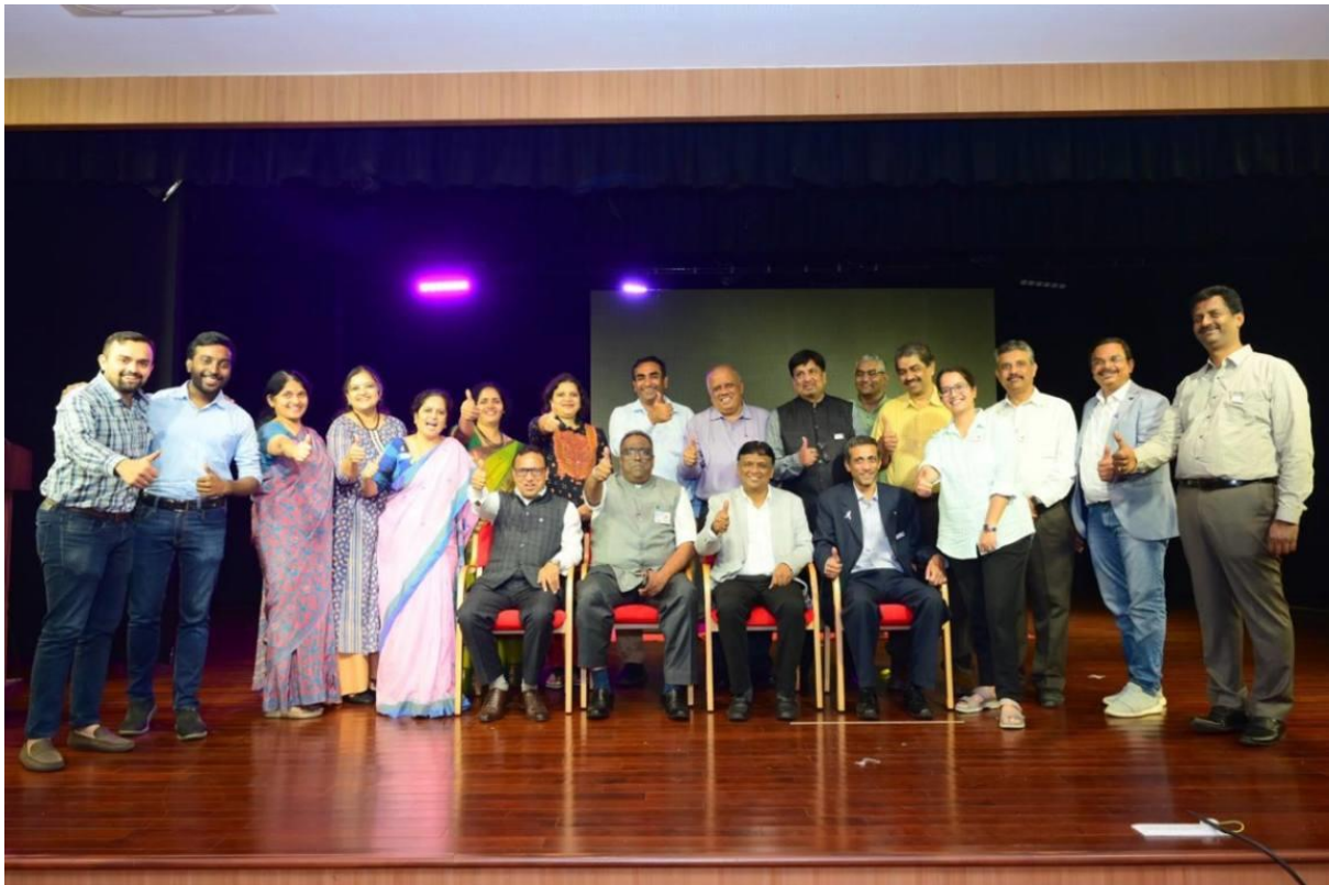
Figure 2: Rotary Club of Bangalore Prime members during Joint Budget Speaker Meet