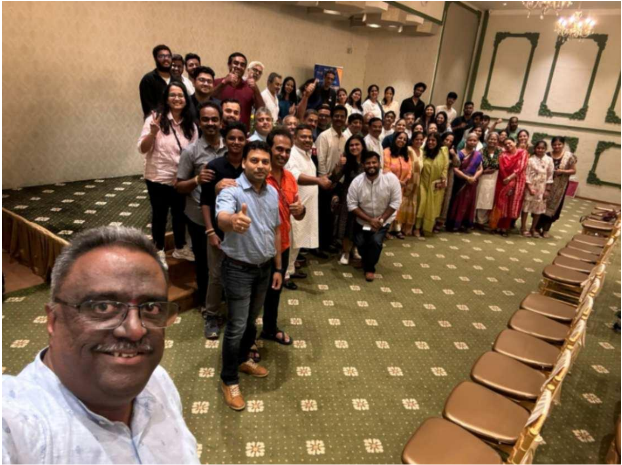
Figure 6: Members and family celebrating Rakshabandhan and Rotaract President Installation on Aug 15th