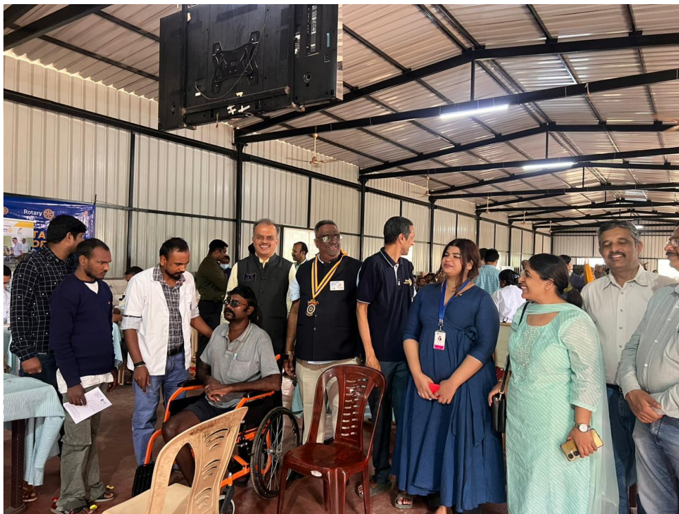
Figure 8: Inmates undergoing Eye screening at AiR Humanitarian Home, Bannerghatta