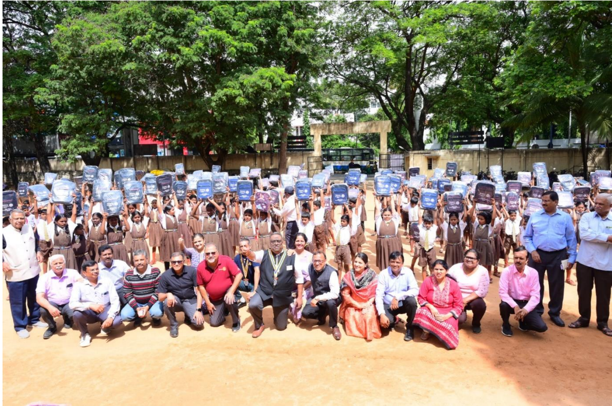
Figure 10: 289 Students with Educational Kits