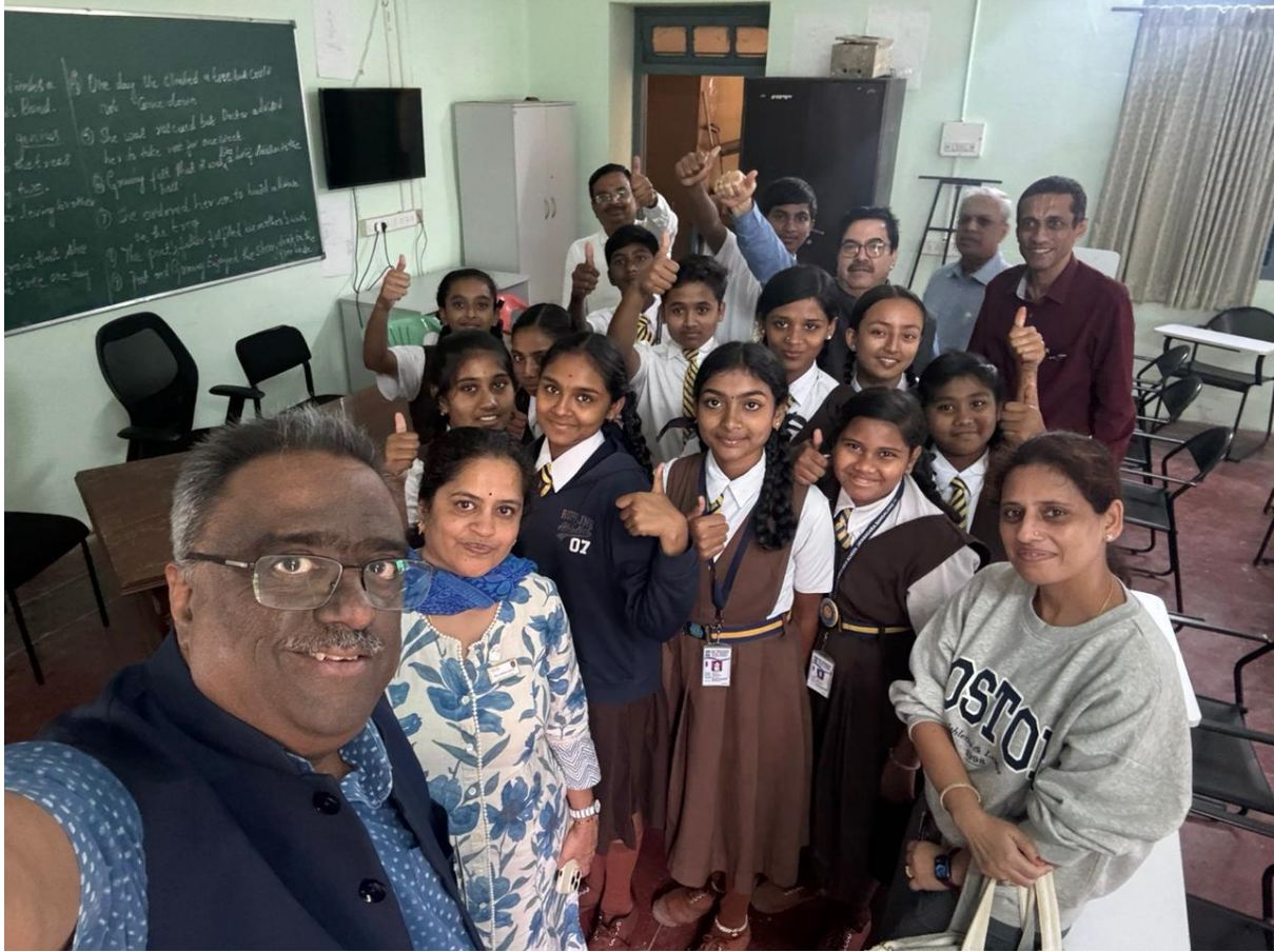
Figure 11: Formation of New Interact Club at Rani Sarala Devi School