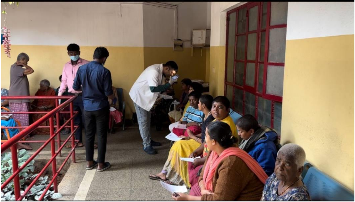
Figure 9: Inmates undergoing Eye Screening at AiR Humanitarian Homes, Chikka Gubbi