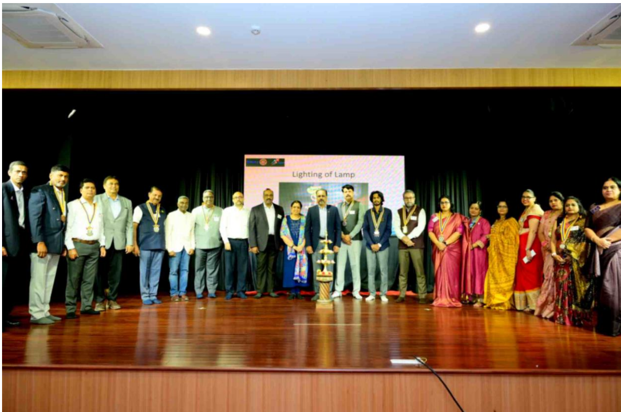
Figure 3: DG, Co-Presidents and other District Officials during Joint Budget Speaker Meet